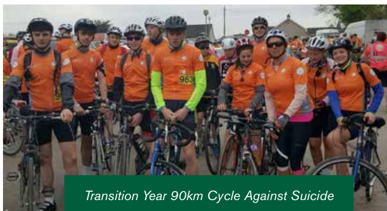
Transition Year 90km Cycle Against Suicide