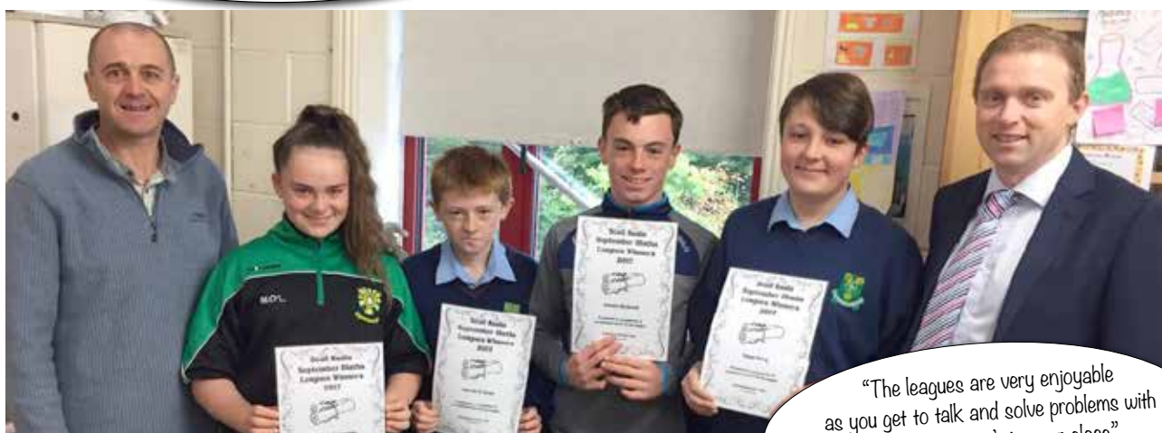
1st Year September Maths League Winners 2017

"The leagues are very enjoyable as you get to talk and solve problems with people who aren't in your class"