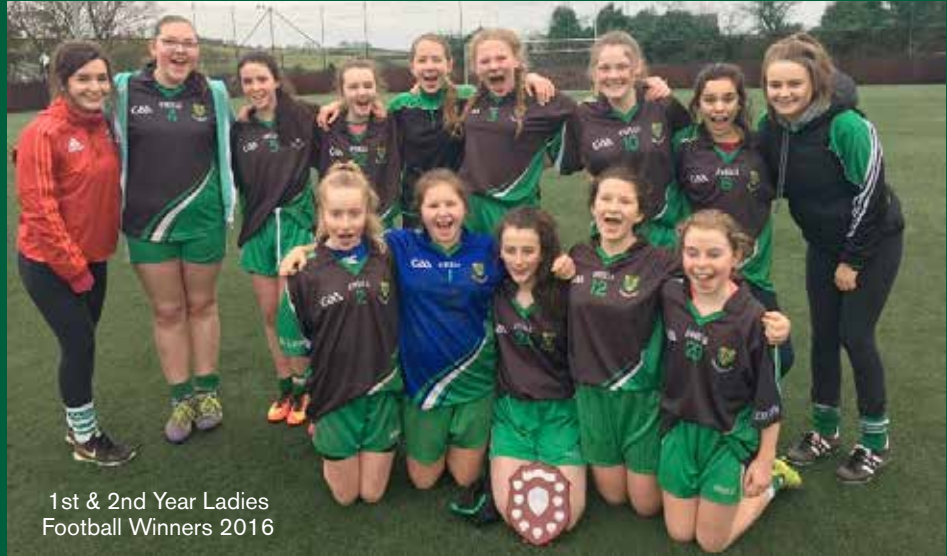
1st & 2nd Year Ladies Football Winners 2016